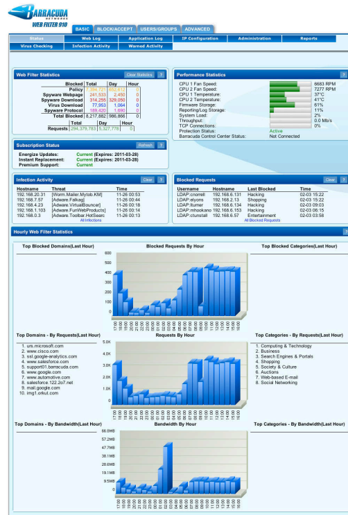
The Barracuda Web Filter monitors attempted policy violations, infected clients, blocked spyware, and virus downloads.

With no software to install or network modifications required, the Barracuda Web Filter is easy to set up. Energize Updates are delivered automatically by Barracuda Central, an advanced technology center where engineers work continuously to provide the most effective methods to combat the ever changing spyware and virus variants. Energize Updates include the latest spyware and virus definitions, along with content filter categories and security updates that are distributed hourly for continuous protection against the latest threats.