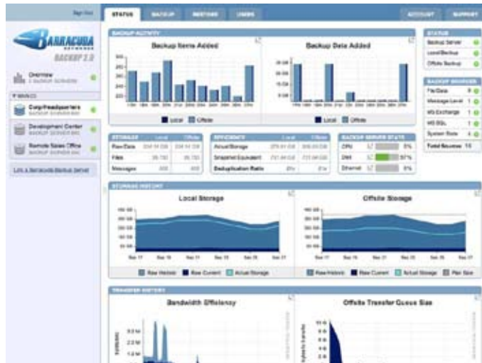
The Barracuda Backup Service Web Interface provides access and displays backup data usage, and allows quick restoration of files.

Deployed in varied and complex IT environments, the Barracuda Backup Service protects mission-critical business information. The Barracuda Backup Agent software for Windows, included with the Barracuda Backup Service, provides complete native backup of Microsoft Exchange Server, Microsoft SQL Server, Windows system state and Windows file system data. In addition to the software agent backup, the Barracuda Backup Server supports other backup methods natively without installing any additional software or agents. The Barracuda Backup Server can back up data directly from network file shares using industry standard protocols. It can also connect directly to Microsoft Exchange and Novell GroupWise to provide message-level backups for more granular restoration of user email messages.